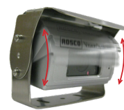
STSC127 Shutter Camera