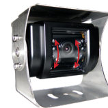
STSC117 Vertical Tilt Camera