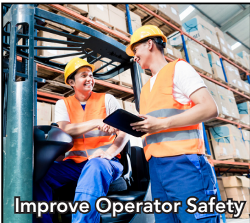
Improve Operator Safety