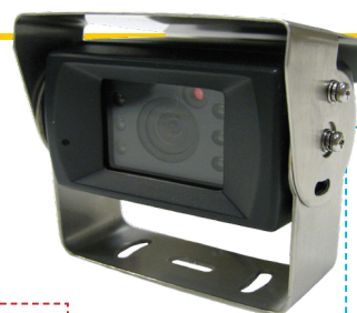
STSC107 Standard Camera