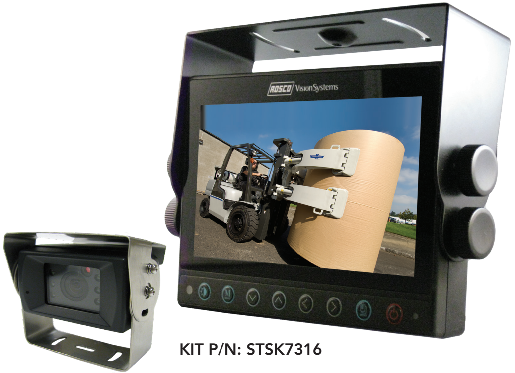
KIT P/N: STSK7316