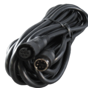
STSH308 Standard Harness