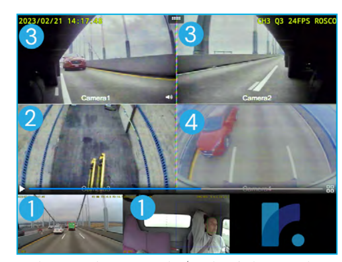
Six camera view on RoscoLive (DV6 in-cab view + exterior windshield view, two side camera views, interior cargo view, backup camera view)